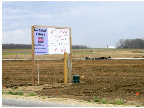
Fiber has been extended to service the new Northfield Estates subdivision in Coldwater.