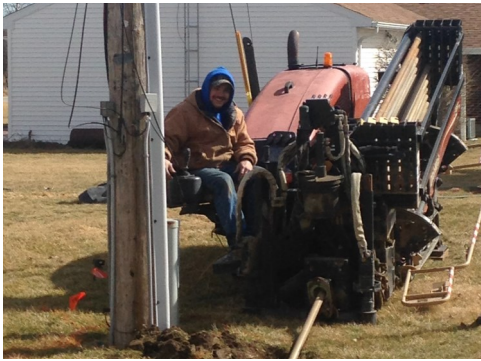
Our crew has been working diligently to bury lines in Rockford.

The hours at the Celina office have been changed to 8:00 a.m. to 5:00 p.m. on weekdays. If you need to contact us after we close, please call our After Hours Department at 419.942.1111.